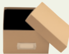
Photo storage boxes are great for organizing more than photos! These inexpensive, versatile tools can be used to store crafts, office supplies, jewelry, small toys, bathroom doo-dads, and so much more. For under $5 each, these boxes are an organizing best-buy. Label them clearly with a label maker or Sharpie pen.